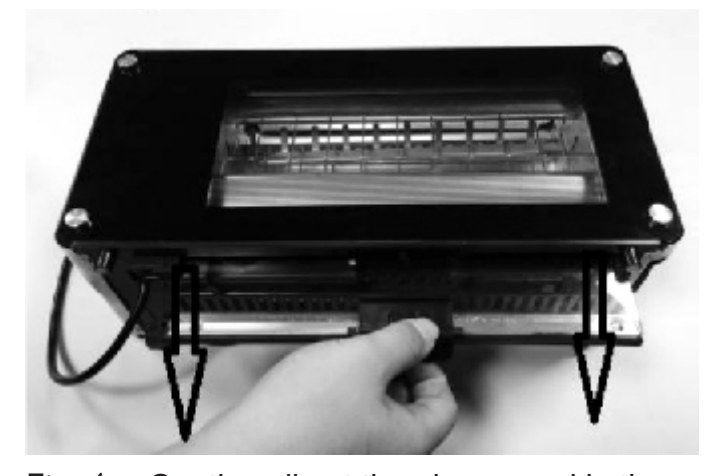
Fig. 4 Gently pull out the glass panel in the arrow direction.

IMPORTANT! When reinserting the glass panel, you must ensure that it audibly 'clicks' securely into place, otherwise the toaster will not work. When the panel 'clicks' into place, a safety switch is activated (see Fig.5). This will ensure your toaster receives power the next time you connect it to your electricity supply.