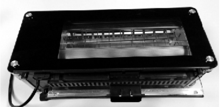
Fig. 5 You must hear it *click* into place to activate the safety switch.